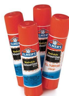
glue sticks (3 pack)