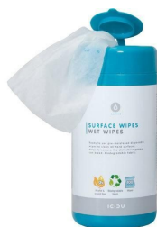
1 or 2 container wipes