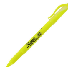
1 highlighter (yellow only)