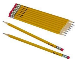
1 pack 20 yellow pencils (NO mechanical)