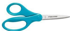
1 pair scissors