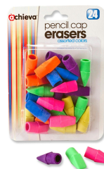
pencil cap erasers (2 packs)