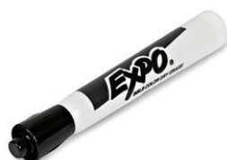
dry erase markers (black only)